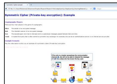
Figure 2. Concrete LO.