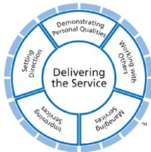
Diagram 2: Medical Leadership Competency Framework (NHSIII & AMRC 2008)

The Medical Leadership Competency Framework) complemented the NHS Leadership Qualities Framework (NHSIII 2006) produced as the benchmark for senior managerial leaders. These have subsequently been super ceded by generic frameworks which seek to accommodate both clinical and managerial roles, and formal and informal leaders (for example the NHS Leadership Framework (NHSLA 2011) and the NHS Healthcare Leadership Model (NHSLA 2013). Professional standards have placed increasing emphasis on the leadership competences both at qualification and at higher levels of clinical practice (Box 1) Reflecting the move towards more integrated care, these not only expect leadership across the same