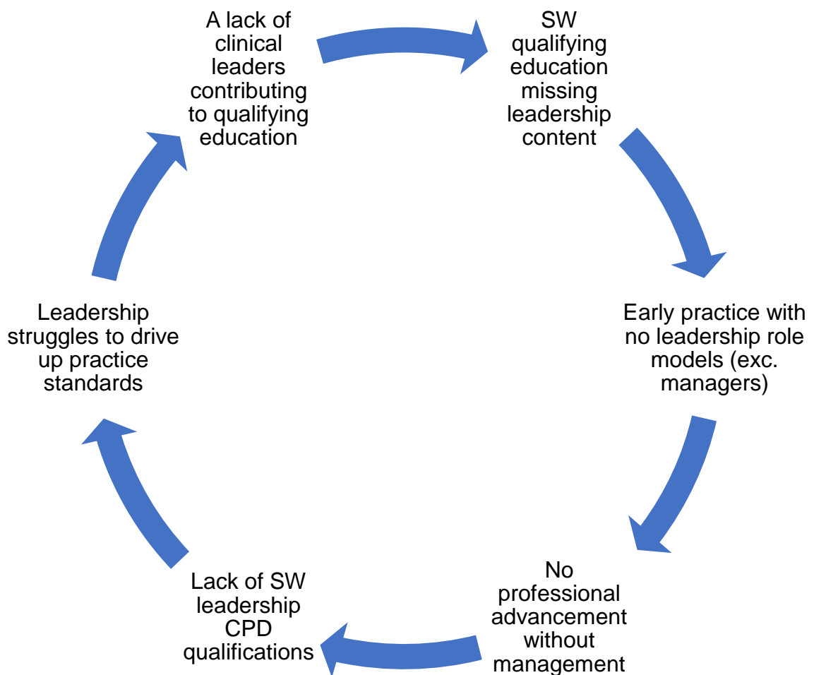
Diagram 4: A cycle of 'missing' leadership

Social work leadership needs a clear definition and relevant models of practice. Distributed, adaptive and collaborative leadership models would all seem to have some accord with underpinning social work values. These could potentially be combined with learning from clinical leadership models in healthcare to develop bespoke social work frameworks and approaches. In relation to a definition, this again needs to build on the distinct principles and purpose of social work, and to be relevant to social work in all the fields in which it is practiced: