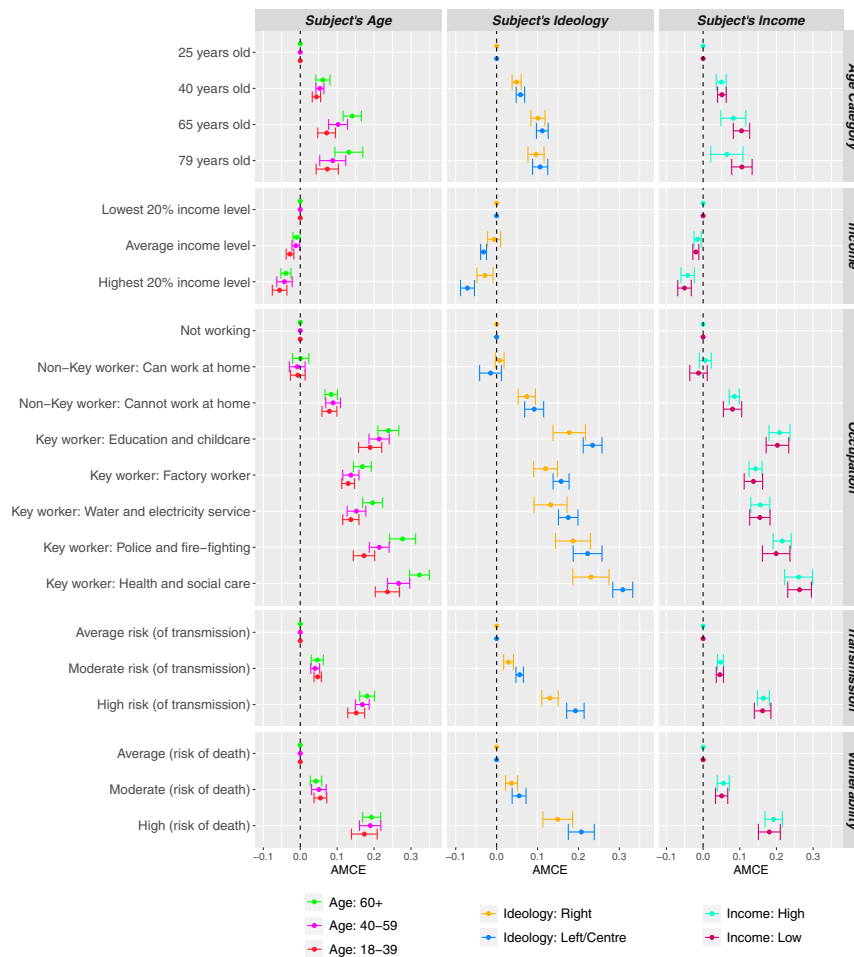
Fig. 3. Vaccine candidate decisions by age, income, and left–right self-identification. AMCE estimates are reported for attribute values (observations are pooled across countries). The 95% CIs are shown for each point estimate, clustered by country. Observation weights are not used.

(Table 1), public preferences for prioritization appear to be largely consistent across countries and larger regions. Moreover, when we estimated the conjoint model for subgroups in the samples, we found that preferences were consistent across a range of respondent characteristics, such as age and income (Fig. 3).