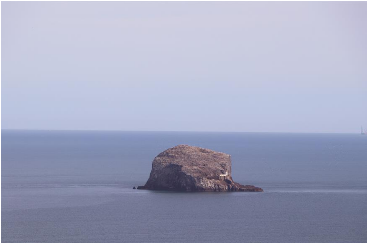
Figure 2: Strange, K. (2020) Bass Rock off North Berwick's coast.

are embodied and made of matter is threatening because the body reminds us of our material existence' (p. 65), but humans must remember. It is only through the reconnection with our material, yet fluid and permeable corporeality that we can begin to understand the interrelationships between both the environment and humanity. The Bass Rock reminds the reader that avoidance does not prevent further exploitation and violence, only silences the voice of its victims and enables the cycle to continue. Silence does not protect us; it only isolates us.