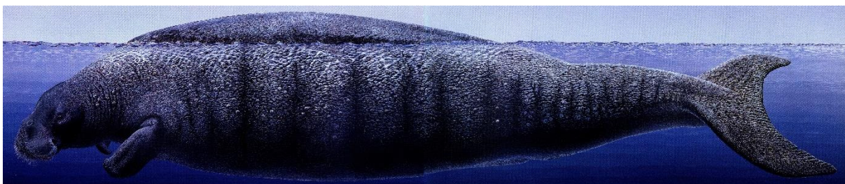
Figure 2: Steller's Sea Cow , Peter Schouten (Flannery & Schouten, 2001: pp. 6-7). Reproduced courtesy of the artist.