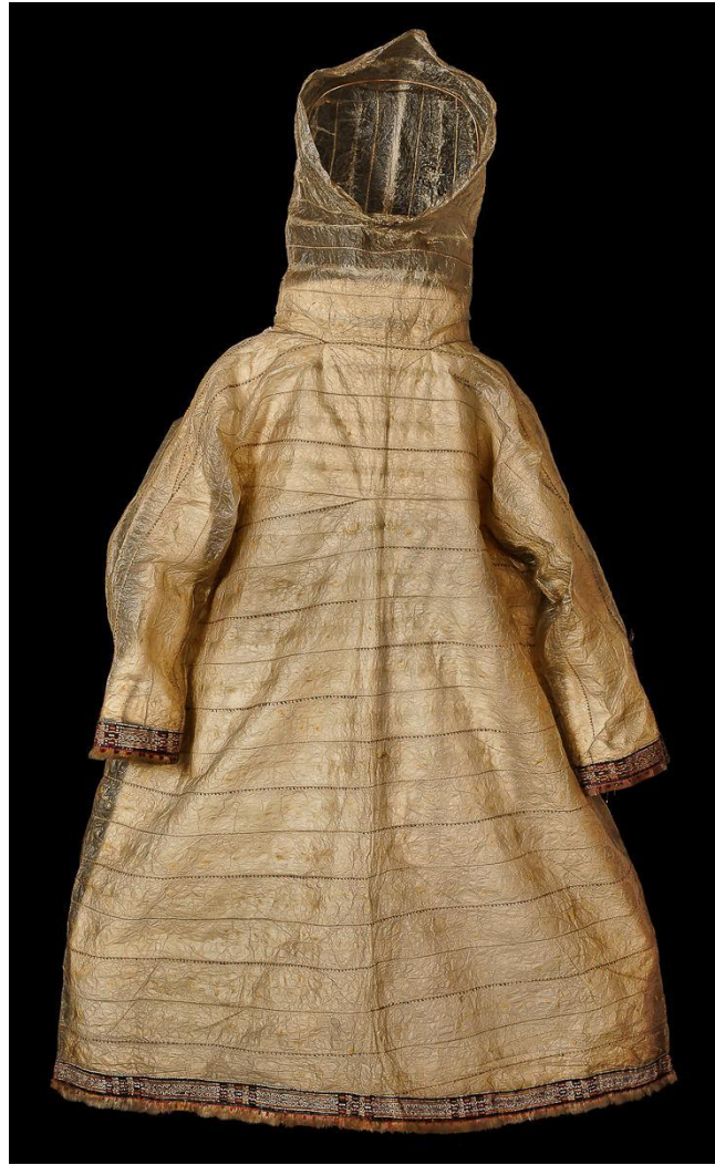
Figure 2: Hooded coat made from seal intestine, Pitt Rivers Museum (1908.73.1)