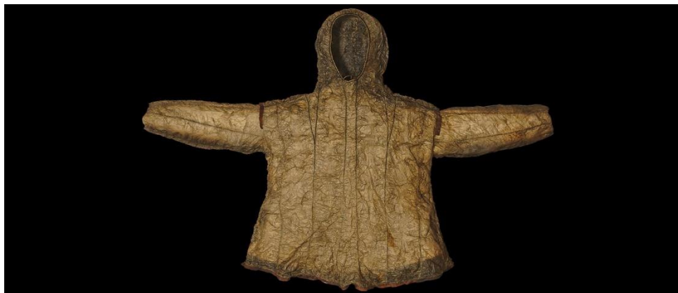
Figure 1: Hooded seal skin jacket, Pitt Rivers Museum (1925.11.3)