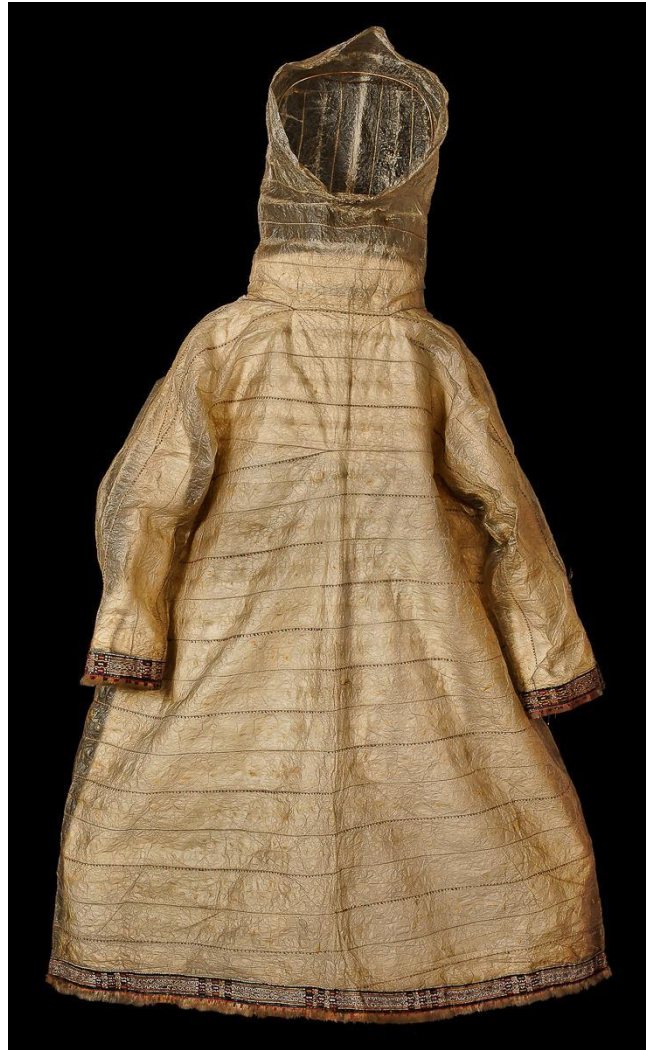
Figure 2: Hooded coat made from seal intestine, Pitt Rivers Museum (1908.73.1)