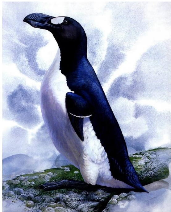
Figure 1: Great Auk , Peter Schouten (Flannery & Schouten, 2001: p. 35). Reproduced courtesy of the artist.

initiatives. Because these two books define wilderness as a place untouched by humans, they ignore the devastating effects of anthropogenic activities—especially Russian and American resource extraction endeavours—on the great auks ( Figure 1 ) and sea cows ( Figure 2 ) inhabiting the coastal ecosystems of the North Atlantic and North Pacific. As I argue, the ecoGothic aspects of their depictions of wilderness only exacerbate this problem, because they serve to characterise some places on the planet as particularly hostile to humans and impervious to their influence.