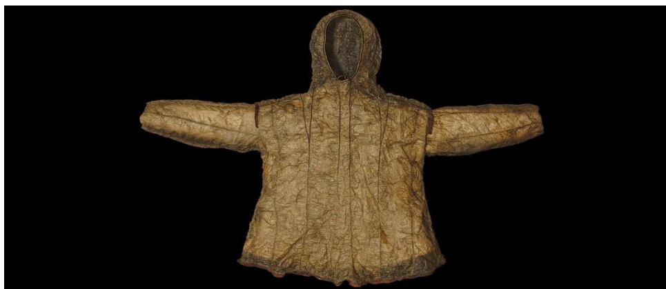
Figure 1: Hooded seal skin jacket, Pitt Rivers Museum (1925.11.3)