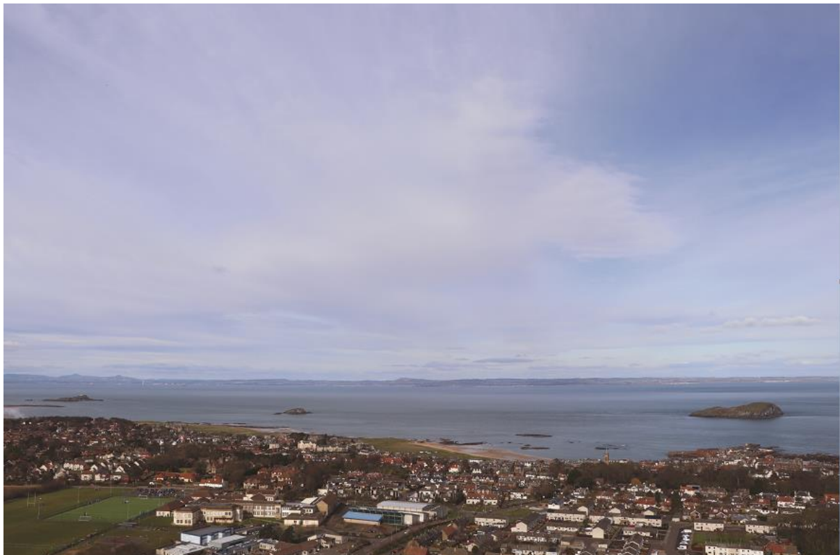
Figure 1: Strange, K. (2020) Small, uninhabited islands off North Berwick’s coast.

of two ecological zones’ (p. 206). Elizabeth Parker and Michelle Poland (2019) argue similarly that rather than being a stable border, the coast does not exist in a fixed state because its topography is constantly changing (p. 4). Land shifts beneath water to form the base of the sea and, just as easily, sea-levels can rise and spread to cover more of the land, subsuming the presumed permanent landscape. This coastal space exists in-between ecological zones; the simultaneous material and fluid physicality of this environment ‘speaks to contemporary preoccupations with the porousness and instability of supposedly fixed and firm borders and identities’ (Packham, 2019: p. 206). The idea that the coast acts as a dividing line is revealed as a social construct that denies the hybrid reality of this ecology. North Berwick is a prime example of this fluidity because the titular, iconic landmark of this coast is one of several small, uninhabited islands that jut out of the sea just off the shore.