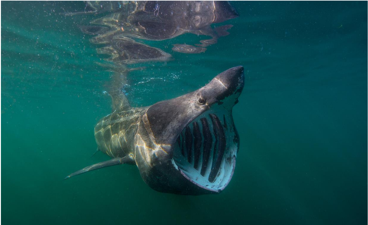
Figure 3: Alexander, M. (2022) Basking Shark Feeding. Scotland.

Wyld's decision to include a basking shark—one of the largest sharks alive—emphasises an irrational fear of the Other. The basking shark can be considered a gentle giant; they do not bite their prey and will not attack humans. However, the sheer size of a basking shark is seen as frightening and potentially dangerous in juxtaposition to the small stature of a human, especially within the unfamiliar, vast expanse of the sea. Thus, the anthropocentric fear of 'so many big things right under the water that we can't see' is subverted by the female corpse, dismembered and stuffed into a suitcase to be made as small as possible, and Viviane's uncanny recognition of the real threat existing beyond the environment (Wyld, 2020: p. 26). It is not the creatures of the deep that have destroyed this woman's body, but a far more familiar culprit. Fear lies not in the sea itself but is rooted in the androcentric desire for absolute material control over both women and ecology.