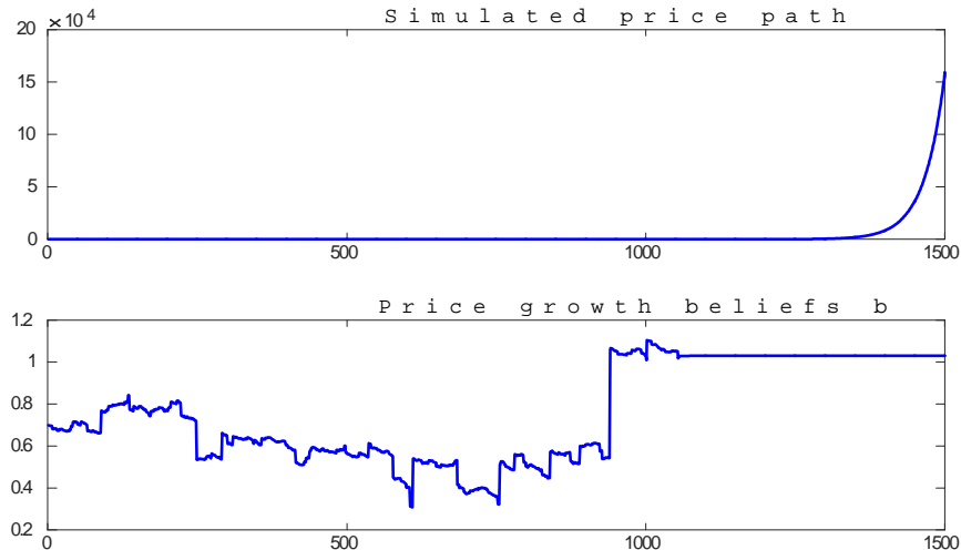
Figure 2: Convergence to the RE explosive solution for good prices

\pi_t = \beta E_t \pi_{t+1} + \varphi i_t where 1 > \beta > 0 and \varphi < 0 . And interest rates respond positively to inflation rate i_t = \xi \pi_{t-1} + \epsilon_t where \xi > 0 and \epsilon_t i.i.d innovations. Combining the two equations yields \pi_t = \beta E_t \pi_{t+1} + \delta \pi_{t-1} + \nu_t where \delta = \varphi \xi < 0 and \nu_t = \varphi \epsilon_t . This is a special case of model (1)-(2). Proposition 1 and 2 imply that the explosive solution is both E-stable and strongly E-stable.