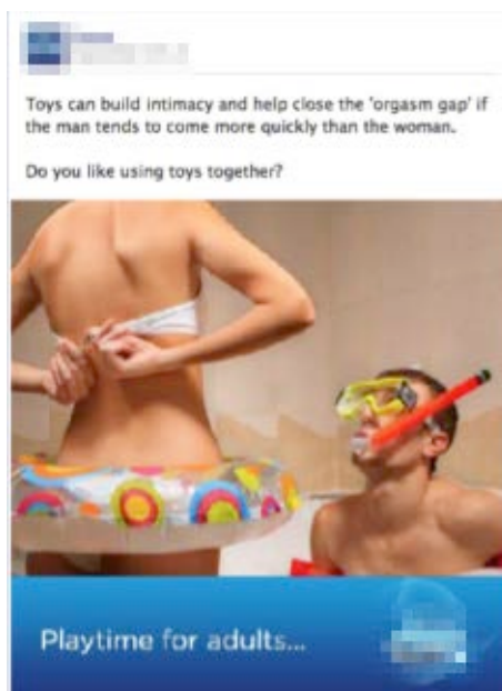
(2) Condom Branded Stimulus