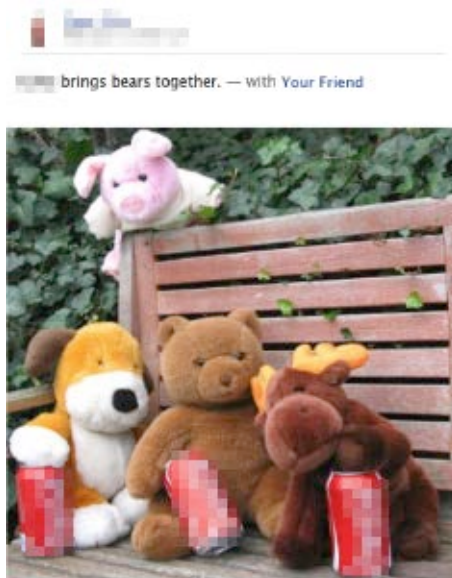
(1) Soft Drink Branded Stimulus

The following images were used as the content for the Brand Interaction (i.e. to measure whether participants would 'like' or share such content) and were presented as stimuli to research participants. The first (1) was used as the Soft Drink stimulus; the second (2) was used as the Condom stimulus.