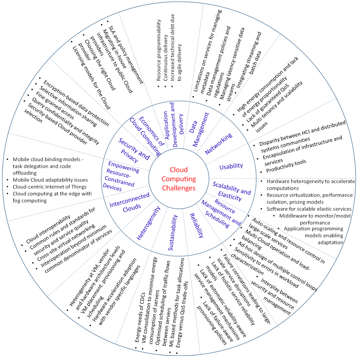
Figure 2: Cloud computing challenges, state-of-the-art and open issues