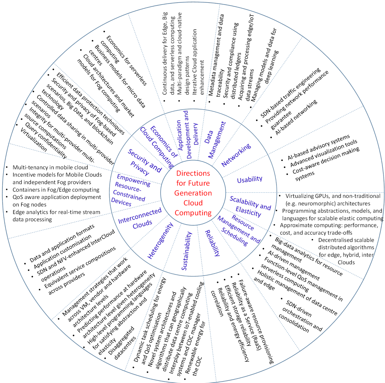
Figure 3: Future research directions in the Cloud computing horizon