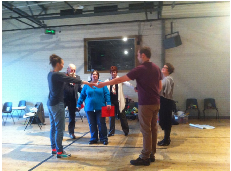
FIGURE 5 Presentation to the government

inclusivity and acceptance of difference. Participants felt that such indicators are more relevant than currently used indicators which actually measure ill health according to parameters such as teenage pregnancy, obesity levels and alcoholism.