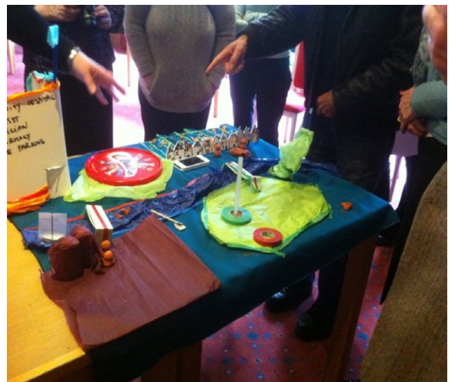
FIGURE 2 Art Installation of a community which has great health

The objects used to create the art installations acted as boundary objects which helped participants make sense of what counted as health to them and share these ideas with other group members. By working together in this embodied and creative way, it was possible for individuals from different backgrounds to connect, communicate and achieve some consensus around a topic that generated strong feelings and emotions. In subsequent interviews, participants reflected on their collective work, commenting that these “healthy communities” were not fantasies in that aspects of such communities already existed or could easily exist if people simply changed their perception and understanding of health. In contrast to the perception of Stoke-on-Trent as deeply unhealthy that was given via the official statistics, the CA activities identified and highlighted positive aspects of the local communities represented in the workshop. One community member said in the follow-up interview: “We don’t need to associate the GP [General Practitioner] with health. The GP wants to deal with ill health issues that can be cured through medication and operations.” This was reiterated by another member of the public: “Communities should come up with their own measures of health. What is measured in health is far from day to day life and the solutions are so huge that communities do not think they could have an influence”