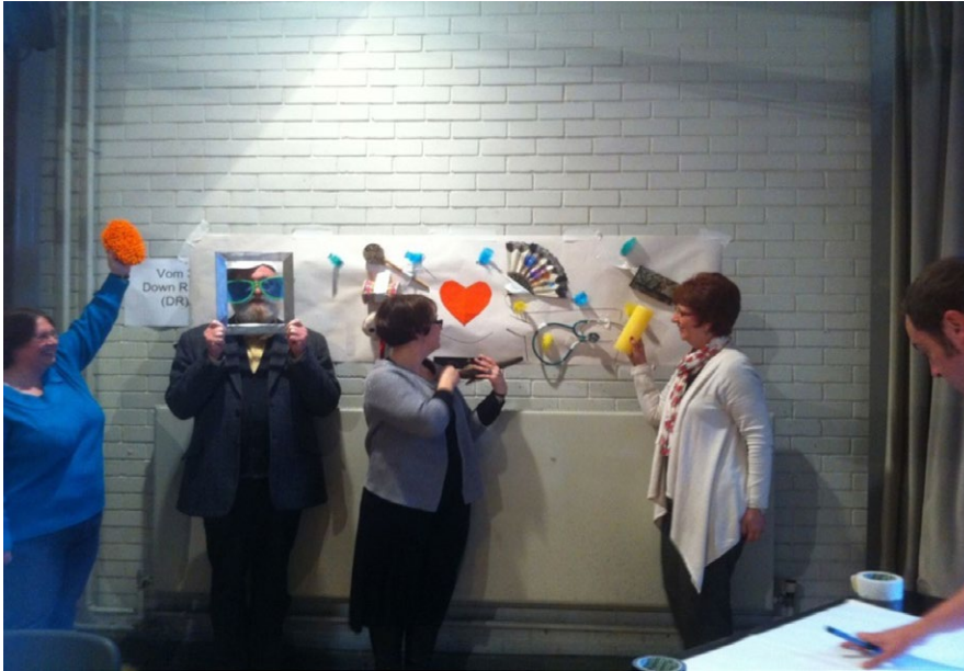
FIGURE 4 Facebook page art installation

The second part of the exercise involved the groups composing a Tweet about good health. This was done in the form of a cinquain (poems comprising 5 lines): the first verse has one word (the title), the second verse has 2 words describing the title, the third verse has 3 actions that make the title happen, the fourth verse has 4 words describing feelings associated with the title, and the final verse has one word which is an alternative word for the title. One group composed this poem about community creativity: