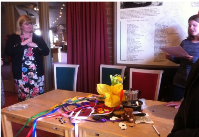
FIGURE 1 Art installation representing a community that has great health

You see here the river, the open green spaces, other people who speak to you