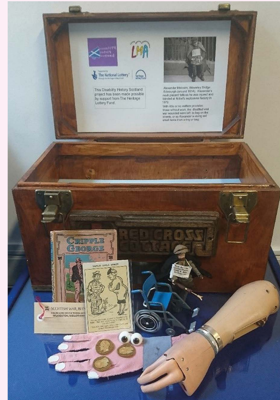
Figure 4 A Memory Chest that used physical artefacts to provide insight into the disability movement.

▼ Taking a landmark event in national history, DHS worked to explore how the new visibility of disabled people, especially war veterans, may have helped to change attitudes not just to disability but also to understandings of mental health and to critical perspectives around concepts of charity and justice. ▲