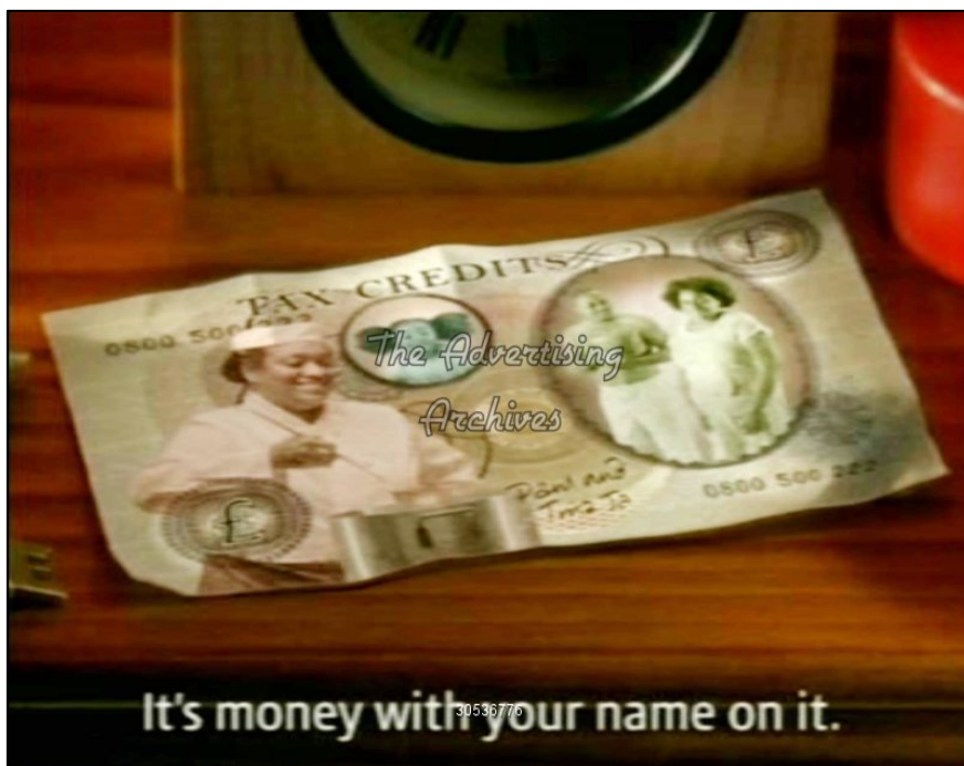
Exhibit 2: HM Inland Revenue Tax Credits television advert, 2004

Exhibit 1 is a still of a television advert for TC. The background resembles a UK banknote. The foreground consist of two panels depicting a happy couple and a smiling baby in domestic settings with the caption “Tax Credits” and “Aaahhh”, suggesting that TC contribute to the well-being and happiness of families.