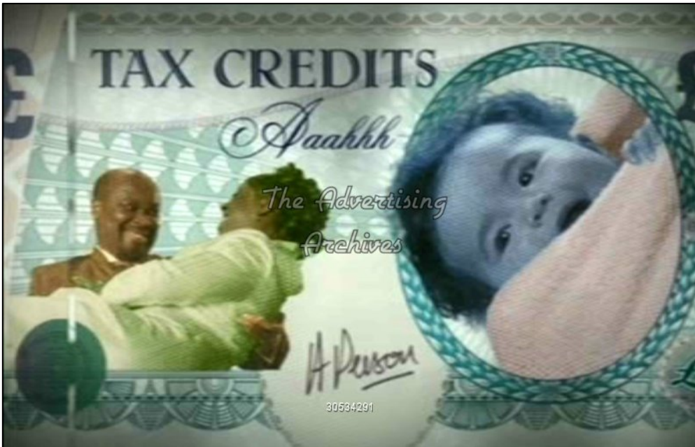
Exhibit 1: HM Inland Revenue Tax Credits television advert, 2003

Exhibit 1 is a still of a television advert for TC. The background resembles a UK banknote. The foreground consist of two panels depicting a happy couple and a smiling baby in domestic settings with the caption “Tax Credits” and “Aaahhh”, suggesting that TC contribute to the well-being and happiness of families.