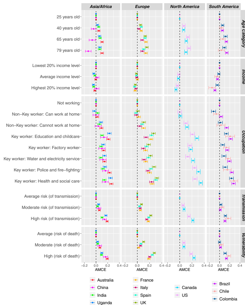
Fig. 2. Vaccine candidate decisions by country. AMCEs are reported for each attribute value. The 95% CIs are shown for each point estimate, clustered by subject. Models are weighted to reflect the respective national populations, excluding India and Uganda, which represent primarily urban samples.

correlations are suggestive; the public in weak-capacity states seem to be more enthusiastic about private provision than is the case in the higher-capacity states in our sample.