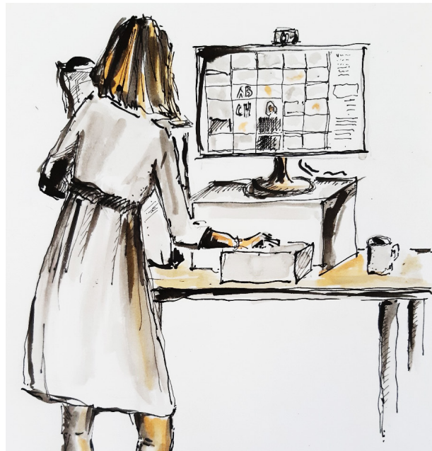
Figure 1 - "Lecturing to images from the kitchen table"

(Received 1 January 2022; revised version received 25 January 2022; final version accepted 21 March 2022)