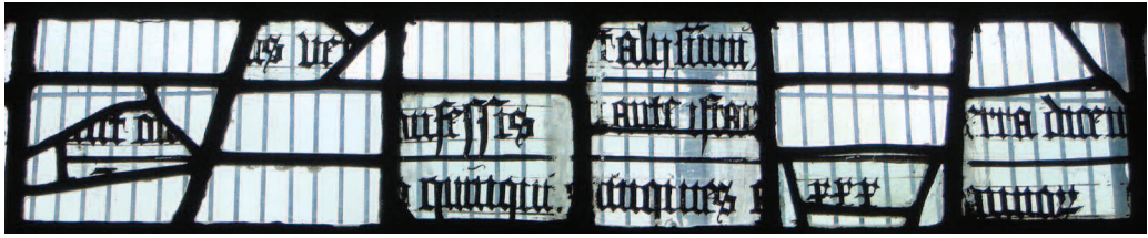
Fig 1. Fragments of an indulgence inscription in glass, All Saints, North Street, York.

Paternosters. Individually the fragments are incoherent; combined they fit into a reasonably common (but not rigidly standardized) pattern.