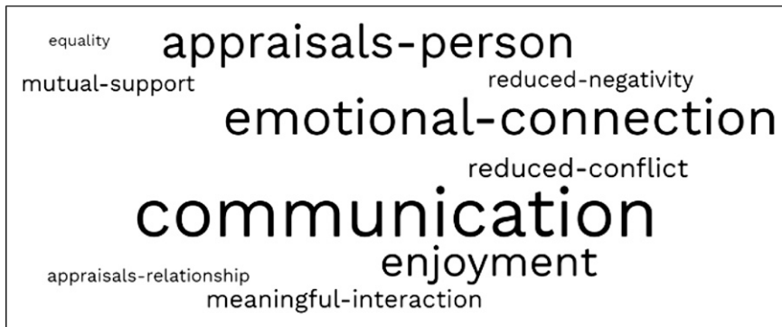
Figure 2. Word cloud depicting frequency of reported relational benefits.

count of the relational outcomes was conducted based on the entries in Table 3 . The word cloud presents more frequently identified outcomes in larger font, and those less frequently identified in smaller font.