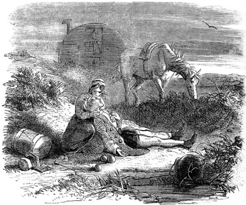
Figure 1: Phiz [Hablot K. Browne], illustration for “The Last Words of Juggling Jerry,” Once a Week 1 (September 3, 1859): 190.

he renders God in his own image—a juggler—rather than vice versa. Jerry’s death is figured as God’s own cheat wherein life on earth is “juggled away” from the living. 27 As for his wife, the poem tells us that she has lived long and hard, yet she appears remarkably young and pretty in the accompanying illustration. Further, the couple’s positioning in the illustration suggests mutual adoration and affection while the poem evinces an imbalance. The juggler attests to his wife’s value—“But it’s a woman, old girl, that makes me / Think more kindly of the race: / And it’s a woman, old girl, that shakes me / When the Great Juggler I must face”—and to her skill in the kitchen as well as her fidelity: “Nobly you’ve stuck to me, though in his kitchen / Duke might kneel to call you Cook: / Palaces you could have ruled and grown rich in, / But old Jerry you never forsook.” 28 Jerry’s trustworthiness is questionable, though, as he also boasts that the queen herself has blest his entertainment. While the dramatic monologue structure requires an implied audience and while the juggler’s wife could be understood as that audience, her steadfast presence in the image overwhelms the ambivalence that grounds much of the poem, where the precise nature of the audience is