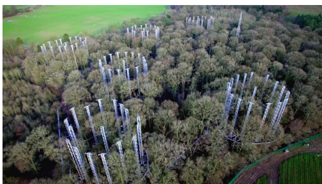
FIGURE 2 Aerial photograph of the BIFoR FACE facility in the Norbury Park estate (UK).

biomes as argued by Norby et al. (2016) and Caldararu et al. (2023). The BIFoR FACE facility is the world's largest climate change experiment and the only forest FACE facility in the northern hemisphere (Figure 2). Over a season, the deciduous woodland patches exposed to elevated CO 2 at BIFoR FACE show about a 25% increase in photosynthesis compared to the woodland in contemporary air (Gardner, Ellsworth, et al., 2022). The general trends and patterns are clear. The 'water cost of carbon gain' is reduced by ~40% under elevated CO 2 (Gardner, Ellsworth, et al., 2022; Gardner, Mingkai, et al., 2022). The enhanced carbon gain influences tree physiology, leading, at least initially, to greater fine root production (Ziegler et al., 2022) and enhanced release of nutritious exudate into the surrounding soil for priming nutrient acquisition for sustaining C capture. This in turn benefits the soil microbiome leading to increased microbial biomass and more carbon belowground overall. The benefits delivered by woodland are determined by location and can be scientifically modelled across landscapes using data from BIFoR FACE and other experimental manipulations to ground-truth model predictions (Norby et al., 2016), thereby increasing our confidence in our strategies for climate-resilient future forests.