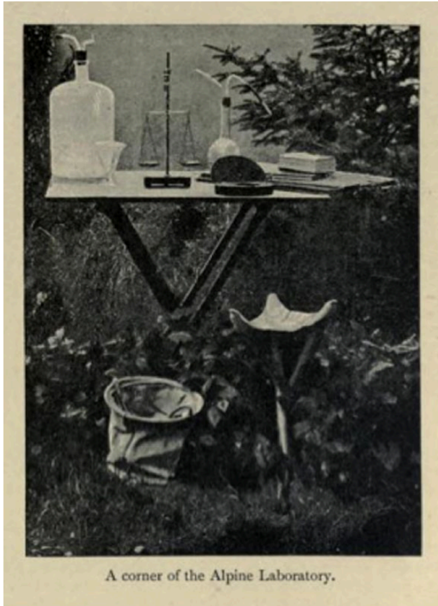
A corner of the Alpine Laboratory.