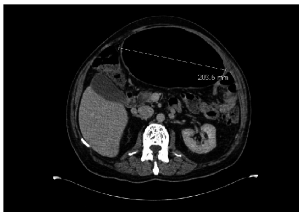
Figure 1. CT showing a 20.3 cm sigmoid mass in keeping with giant diverticulum.

A 65-year-old gentleman presented with abdominal distension and pain. CT confirmed a 20 cm sigmoid diver-