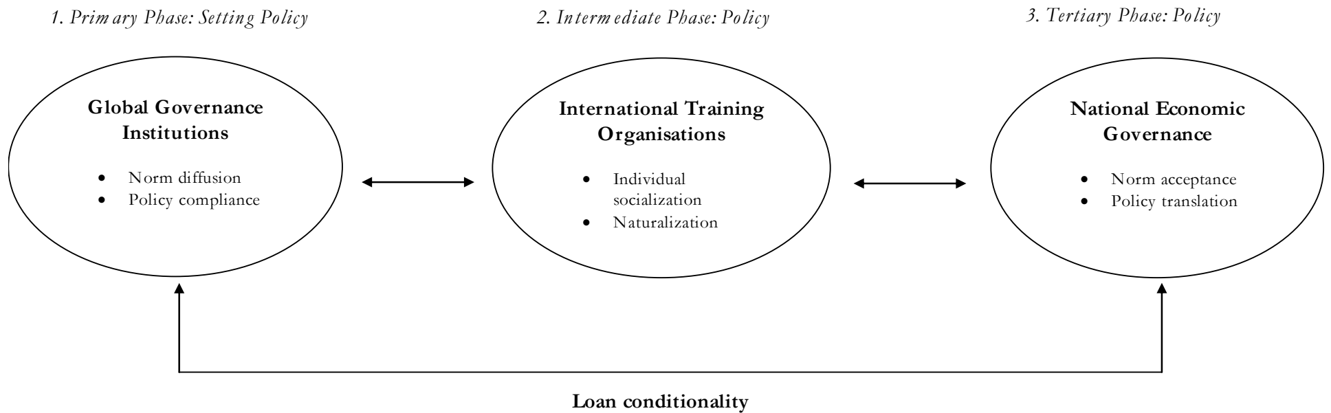
Figure 1. Three stages of intellectual socialization in post-communist economies