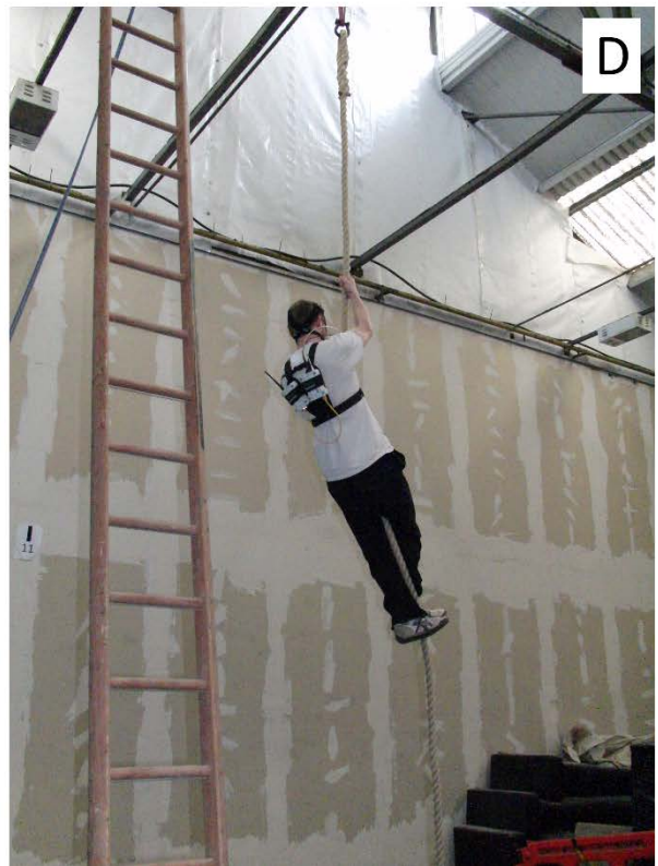
Figure 1. Horizontal jumping (A); pole swaying (B); climbing a ladder (C) and a rope (D).