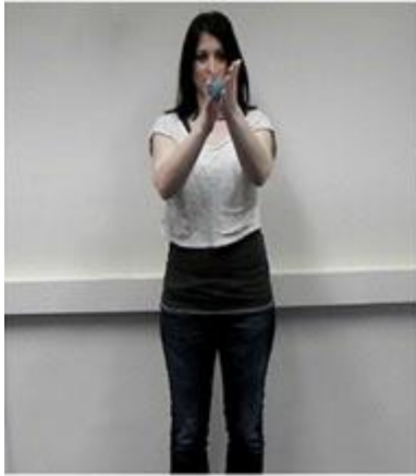
A: Exemplar video 1