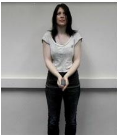
C: Test video 1