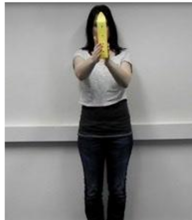
D: Test video 2