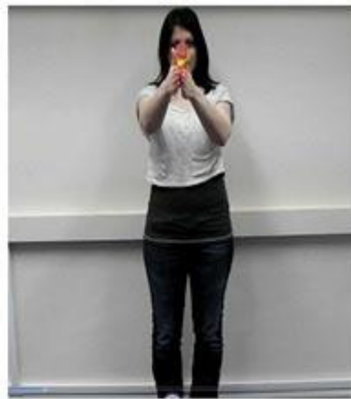
B: Exemplar video 2