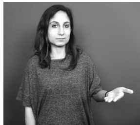
modified for patient

Verb ends at a location in front of/away from the signer on the sagittal axis and either does not correspond to a location set up for the patient or no location was established prior to the verb's articulation.