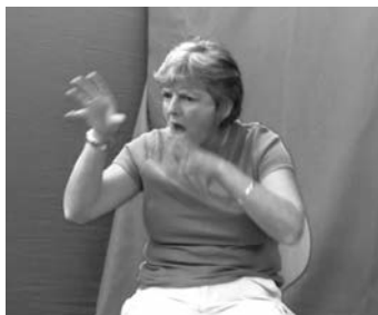
FIGURE 3. Constructed action with the lexical sign LEARN.

Lastly, we also coded for presence and absence of constructed action (elements of enactment; Metzger 1995). A distinction can also be made between overt displays of constructed action (e.g. involving the whole body) and minimal displays of constructed action (e.g. involving the use of facial expression or eyegaze alone). For the purpose of this study, we define constructed action broadly as the use of one or more articulators (e.g. head, face, eyegaze, body, arms, and/or hands) to mimetically represent a referent's actions, utterances, or feelings (Cormier, Smith, & Sevcikova-Sehryr 2015). Following this definition, we coded constructed action as either present or absent. An example of the use of constructed action with the lexical verb LEARN is provided in Figure 3. In this example, the articulators involved in this use of constructed action are the eyes, facial expression, the head, and the torso, and the signer is representing herself in the past (when she attended school while young and learned to sign from her peers). Her facial expression and mouth action convey the sense of surprise and wonder she experienced as she learned BSL for the first time from her deaf peers at school.