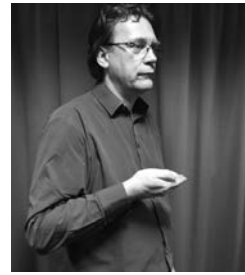
congruent for agent

Verb begins at a location other than near the signer (e.g. away from the signer).