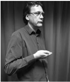
unmodified for agent

Verb begins at a location near the signer and either does not correspond to a location set up for the agent or no location was established prior to the verb's articulation.