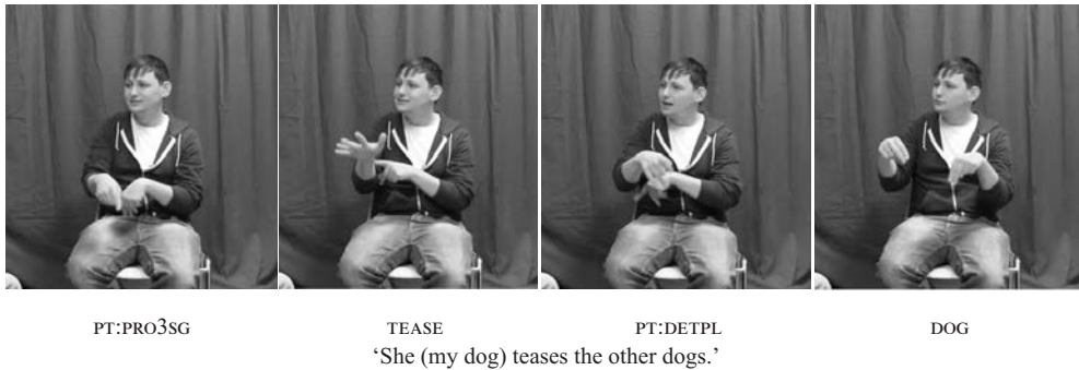
FIGURE 4. TEASE unmodified for the agent and patient.

it may be that these verbs can be modified but happened to be unmodified consistently within our data set), then the overall rate of modification would have been even lower than what we report here. In Figure 4, we provide an example from our data set demonstrating when agent and patient modification do not occur.