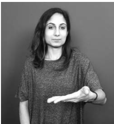
unmodified for patient

Verb ends at a location in front of/away from the signer on the sagittal axis and either does not correspond to a location set up for the patient or no location was established prior to the verb's articulation.