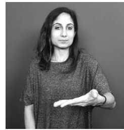
congruent for patient

Verb ends at a location other than the one in front of the signer along the sagittal axis (e.g. to the left).