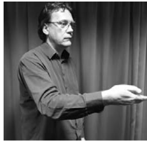
modified for agent

Verb begins at a location near the signer and either does not correspond to a location set up for the agent or no location was established prior to the verb's articulation.