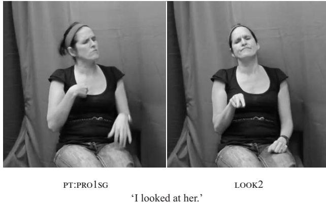
FIGURE 6. LOOK2 with constructed action and modified for the patient.

phemes and deictic gestures. During periods of constructed action, signers appear to be interacting with absent referents as if they were physically present within the signing space, as in Figure 6 where LOOK2 is produced with constructed action. The fact that we observe an increased likelihood of modification during periods of constructed action suggests that signers may be pointing to imagined referents (see also Cormier, Fenlon, & Schembri 2015).