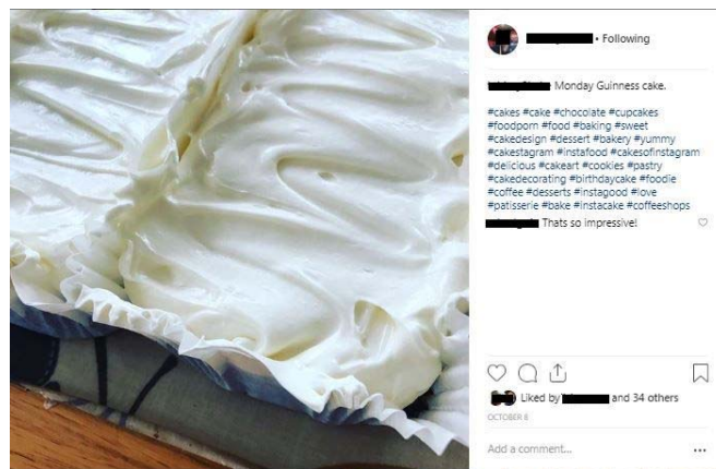
Figure 2. Instagram post event showing an image, caption, comments and likes.

#cakes #cake #chocolate #cupcakes#foodporn #food #baking #sweet#cakedesign #dessert #bakery #yummy#cakestagram #instafood #cakesofinstagram#delicious #cakeart #cookies #pastry #birthdaycake #foodie#coffee #desserts #instagood #love #patisserie #bake #instacake #coffeeshops .