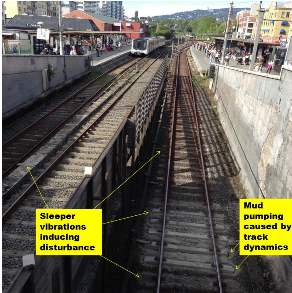
Figure 1 a) Real evidence of structural vibration impairing track performance and damaging track components. Obvious track gradient implies that any drainage problem could be minimal in this situation.