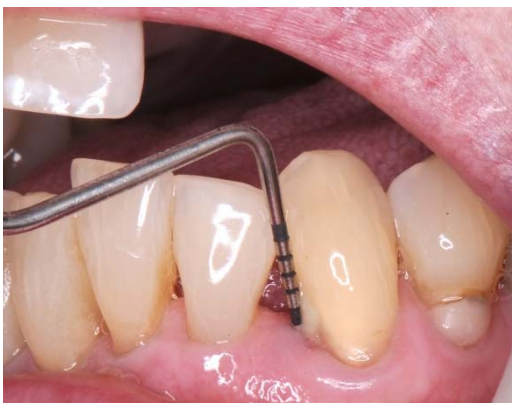
Figure 2 shows a probe inserted into a mesio-buccal pocket with suppuration evident. Consider the environment that the probe is in. Is it “inside” or “internal” to the body? Or can it be thought of as being on the “surface” of the body? Bacteria that exist in this environment, exist in a biofilm on the surface of the tooth and planktonically in the exudate from the pocket.

this external infection is compounded by the fact that the bacteria are present in a biofilm, as opposed to floating around planktonically,